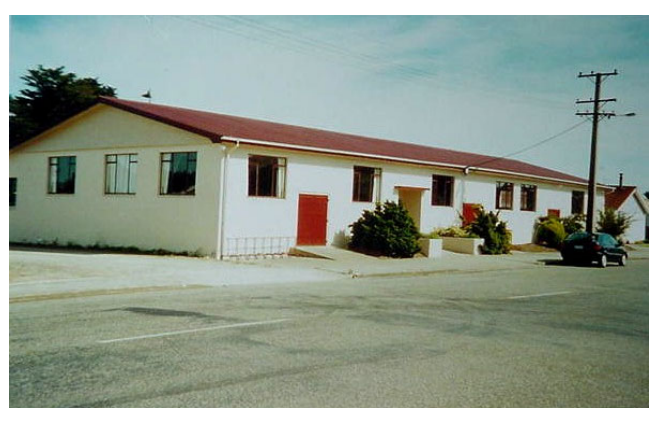
The building purchased by GPC Gore