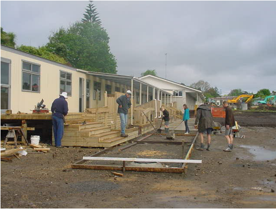
Work has continued on Covenant's site with a big drainage project and new classrooms and decks being built for the Christian School

call many to himself even at this young age.