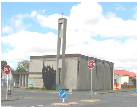
Grace Presbyterian Church, Invercargill's new building - formerly Georgetown Baptist Church,

and worshippers at the first service held in the new building