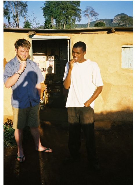
Brushing our teeth with sticks outside a mud hut.