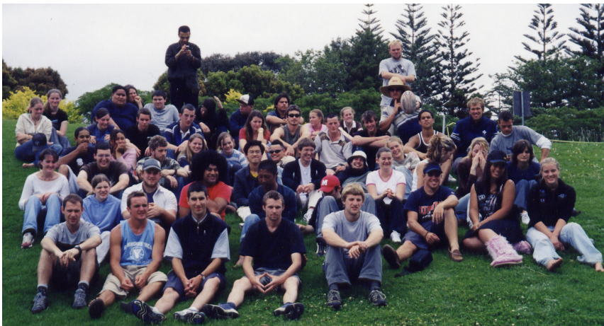
Attendees at YBC 2004/5

YBC is such a great opportunity for like-minded young people from all over NZ to get together for fellowship and spiritual growth. It is always encouraging to see so many young people with the desire to deepen their knowledge and love of Christ and their relationship with him. If you are in fifth form this year or older we want to see you at the next YBC! You will be changed, challenged and encouraged.