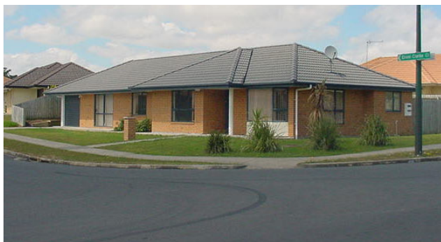
Redeemer's ministry house

the Beatitudes, describing the status and character of the citizen of Christ's kingdom.