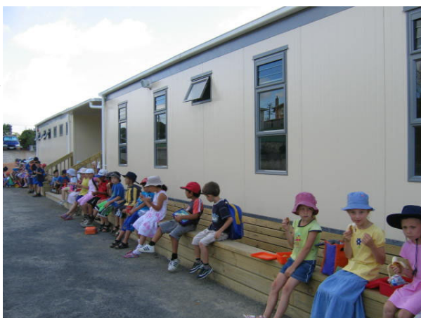
Manukau Christian School—buildings now complete

* Preaching: We are working through 1 John in the morning which highlights the dangers of modern-day Gnosticism and the need for Christians to be sure of their faith in Christ. In the evenings we have been enjoying