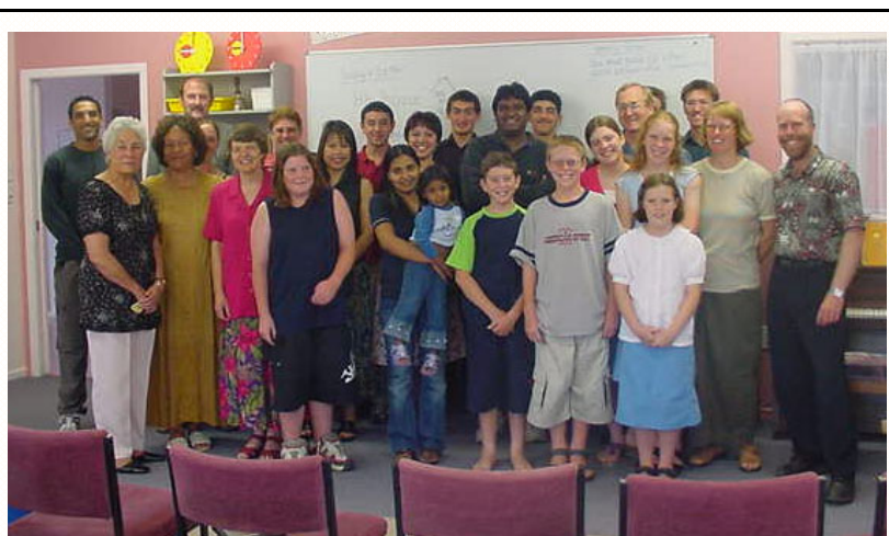
A new GPCNZ church begins—see p 5