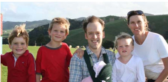
The Seccombe family from Covenant