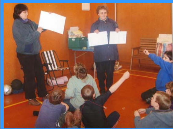
"ASK" children's club at Tokomairiro Grace Bible Church