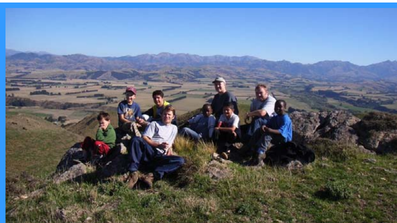
EPC Christchurch boys' group up in the mountains