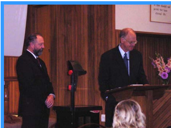
A New Minister in Ashburton - see p. 7