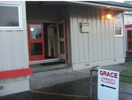
The meeting place for Grace, New Plymouth

build His church. As we trust in Him who is totally trustworthy, and continue to step out in faith, we can expect the God of all creation to enable, provide, and do immeasurably more than all we ask or imagine, according to His power that is at work within us (Eph. 3:20). To Him be the glory, and may the new church in New Plymouth be a blessing to many souls.