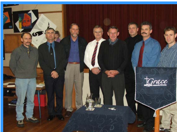
A New Church in New Plymouth - see p. 3