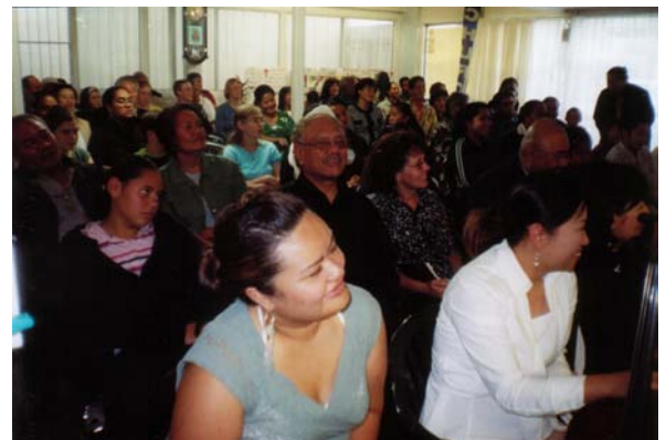
3rd Birthday Celebration at Sovereign