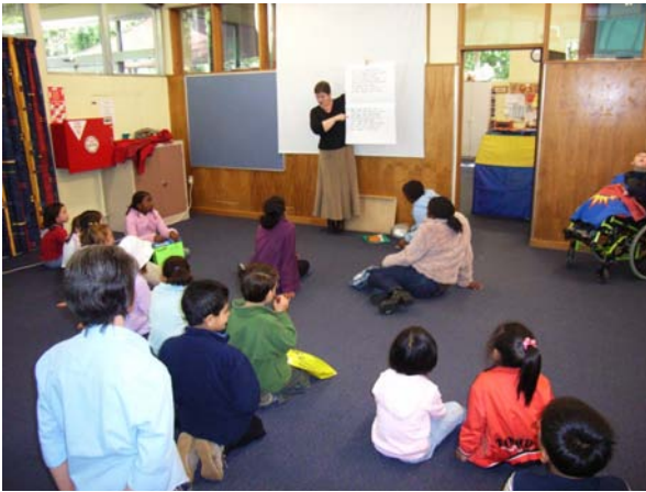
EPC Christchurch's multi-ethnic Sunday School