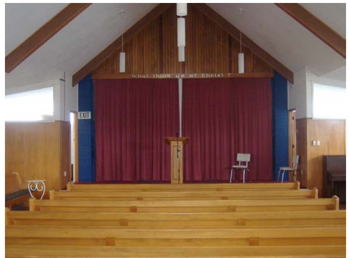
Inside the Bethel Chapel

We give honor and credit to the leadership at Bethel Chapel who are eager for this to happen. Though it means considerable change in ministry in and from this building, they are committed to it out of a desire to see faithful gospel ministry flourish in Gisborne.