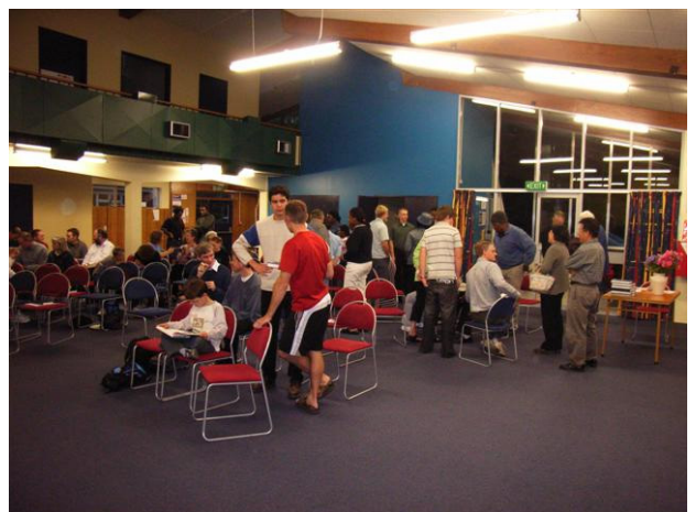
Special prayer meeting at EPC Christchurch for a sick member