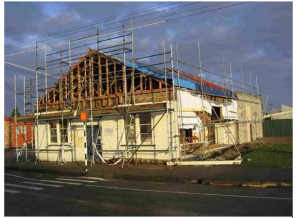
Wyndham Evangelical Church's building renovations

to be with the Lord- a blessing for her, but it leaves another gap in our congregation. Pray for her husband and family .