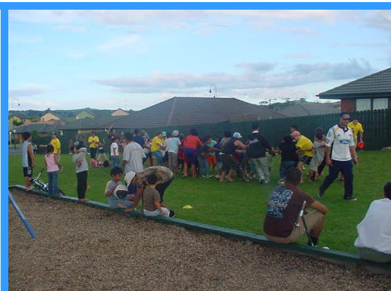
Redeemer GPC's "Easter in the Park" community event and "Musicise class"