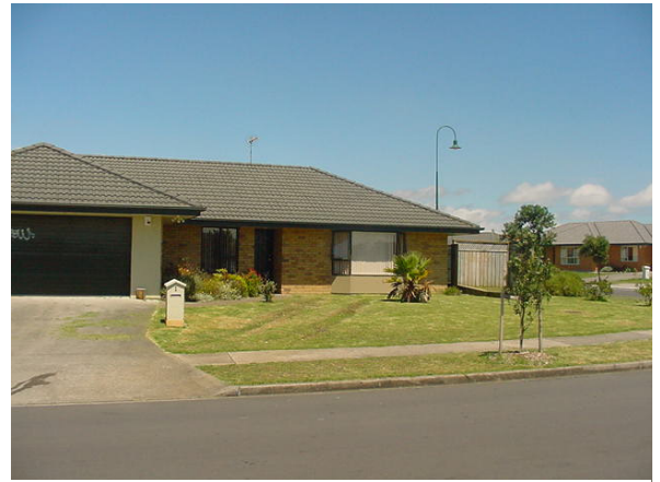
Redeemer's new Ministry House