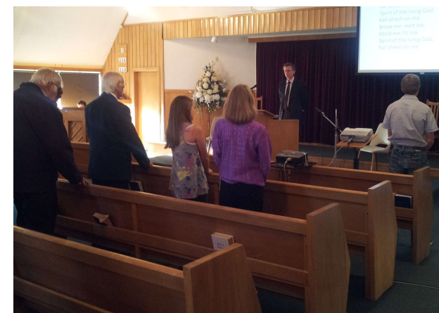
Sunday morning service at Wanganui Grace Evangelical Church