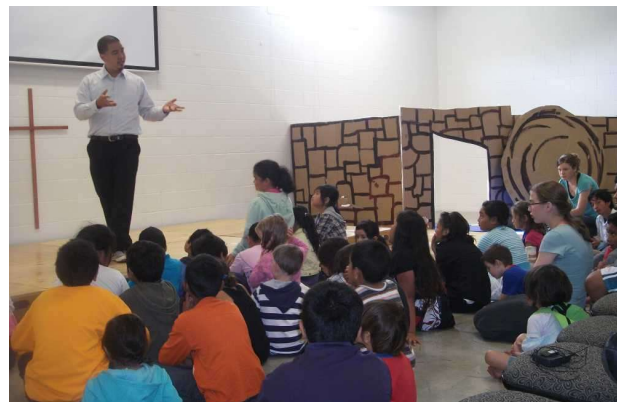
Mission Students from Sydney at Redeemer's Easter Services

Finally Redeemer welcomed a team of mission students from Sydney Presbyterian Theological College this past week and they helped us in our Easter services for both the preschool and kids church programmes. We were richly blessed in these services with just on 100 preschool parents and whanau attending the preschool service and 50 kids and some of their families attending the kids church event. Continue to pray for the gospel to change the lives of families in our community.