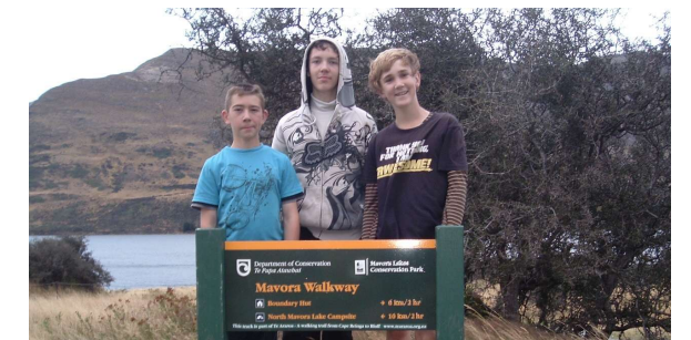
Boys from the Gore Youth Group at Mavora Lakes

We also have the East Gore Playgroup using our building every week. This is not a church outreach as we didn't have the people to run a play group, but its being run by mothers of our youth group kids as a community group. They are getting a around 5-8 mothers and 8-15 kids and its only been going a month. Pray that we may be able to connect with those who come!