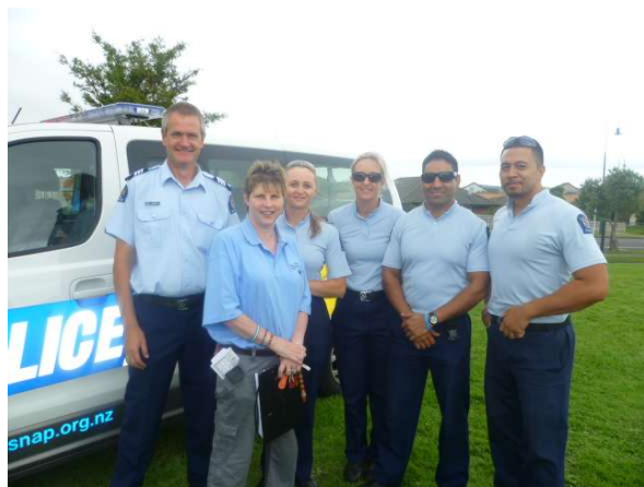
The Neighbourhood Policing Unit working with Redeemer

We have also had a new relationship form with a neighbourhood policing unit – photo attached. Last year the Police department in our South Auckland area decided that they needed to implement a new way of policing (or an old way returning!) where police are to be seen as helpful and friendly rather than just the chase and lock up type. These 7 police have been allocated to work in the same area that Redeemer works in – approximately 600 homes and two weeks ago the police put on a neighbourhood event in our park. We offered to support them with face painting and BBQ help and invitations to the families we knew. They were very keen and the event was a great success for all involved – the police provided all the sausages, food and face painting resources – Redeemer arrived with 6 helpers and we had a wonderful time connecting with the neighbours again at the expense of the Police – great budget winner!! But more than that we were blessed to have 4 new kids at church the next day as a result of the new and renewed contacts.