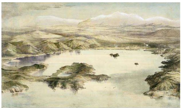
Wellington Harbour (Port Nicholson) and the City