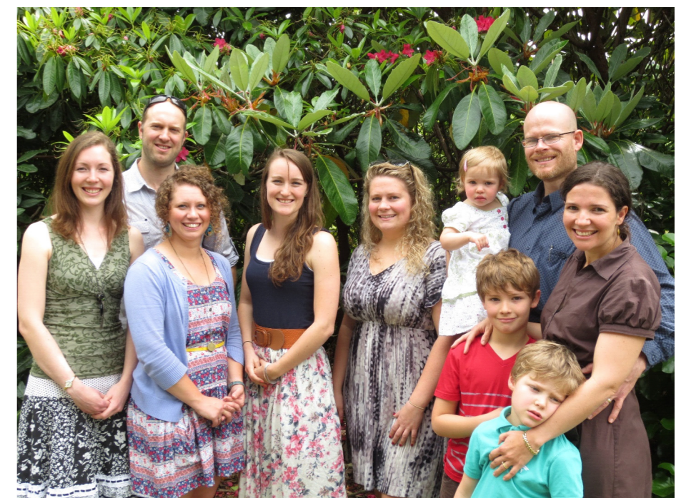
Top: Ice Cream fun during winter in Dunedin