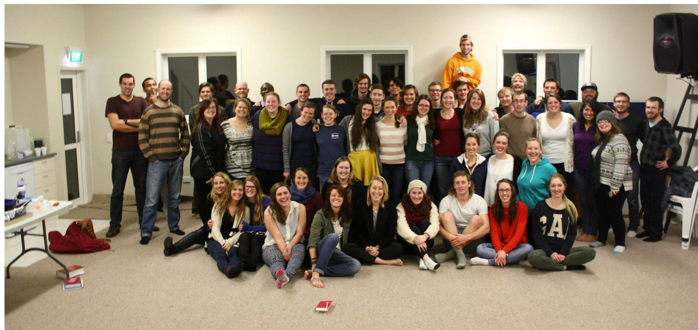
Above: Staff, Students and the American Team in the newly renovated Grace House

Having established students in the faith, we then seek to equip those students who show that they are faithful to God, available for more training, teachable and hungry. Our desire is to see labourers raised up who are faithful disciples of Christ who will make disciples (2 Timothy 2:2). This primarily happens through getting the student involved in ministering to other students, training in discipleship groups and individual appointments. Through life-on-life discipleship we seek to go deep with a few students, believing that a deep investment in a few is the best thing for us to do in order to help these students to multiply their lives and have a Kingdom impact, just as the 12 apostles multiplied their lives.