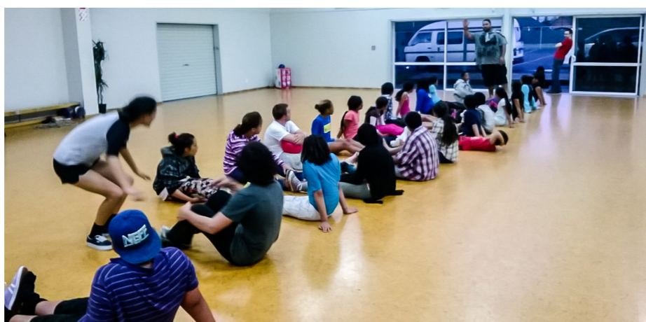
Top: Takanini kid's Breakfast Club