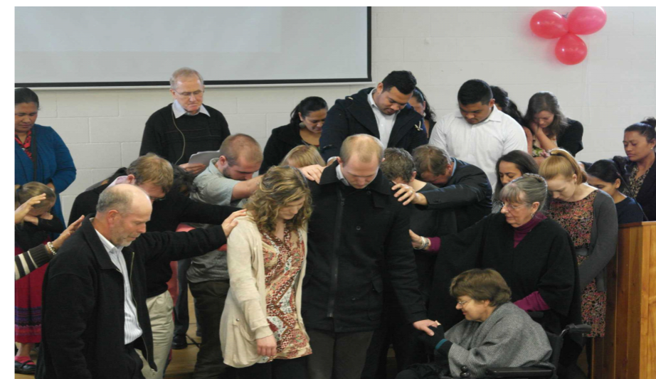
Top: Having fun during the school holiday programme