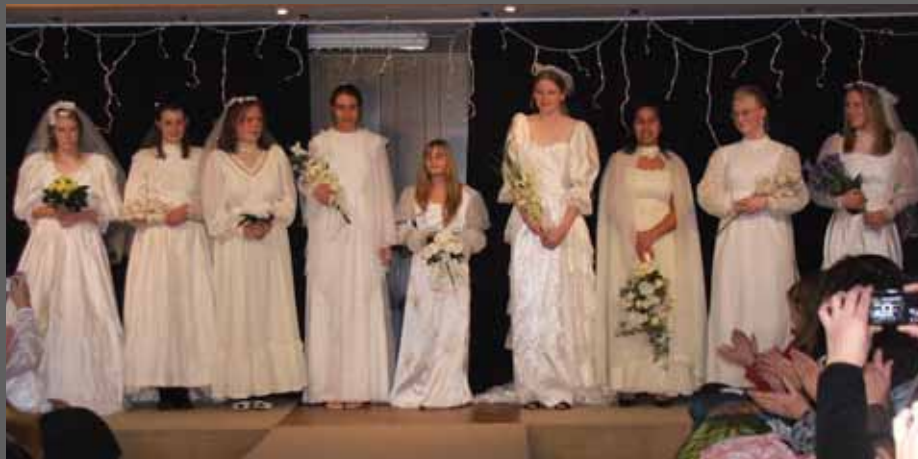
Dresses from 1971 - 1989