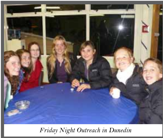
Friday Night Outreach in Dunedin